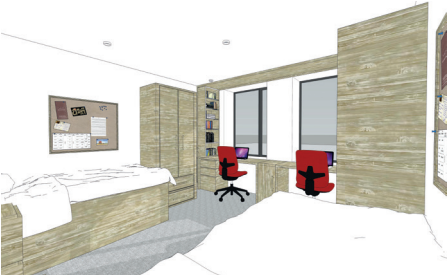
Twin rooms for Removes & Fiftths