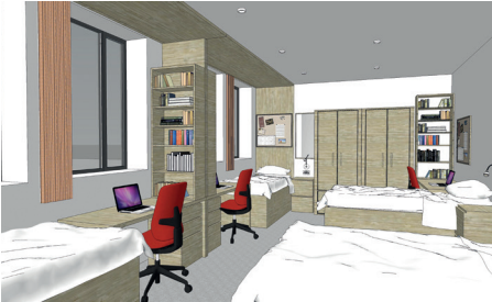
Quad rooms for Fourths (Year 9)