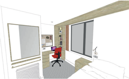
En-suite rooms for Specialists (Sixth Form)