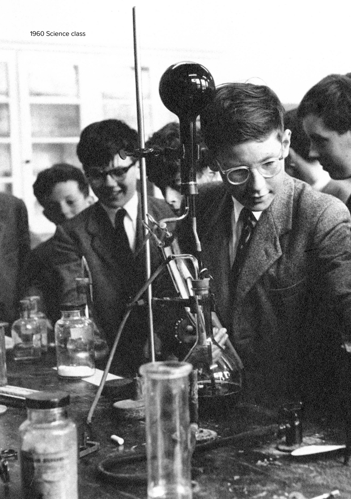
1960 Science class