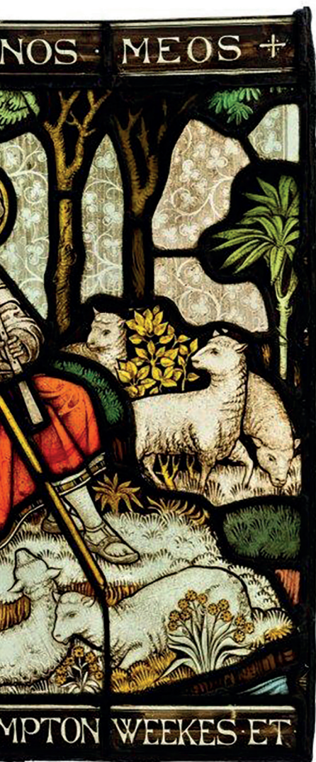
Stained glass recovered from the original School chapel