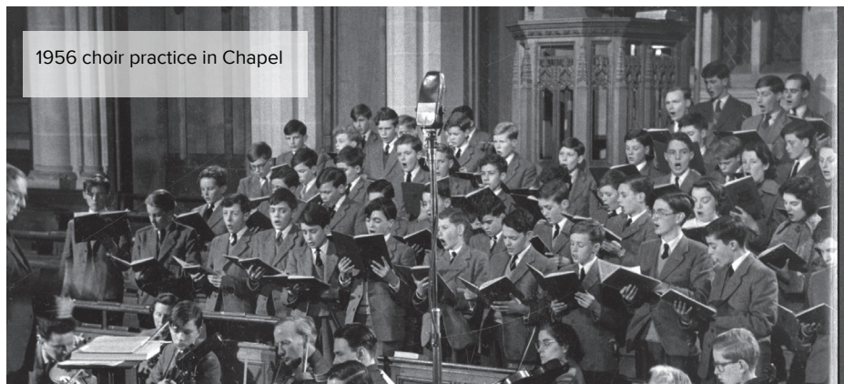
1956 choir practice in Chapel

We hope you share our belief in the value of the education we provide and that you will consider supporting the School in this way.